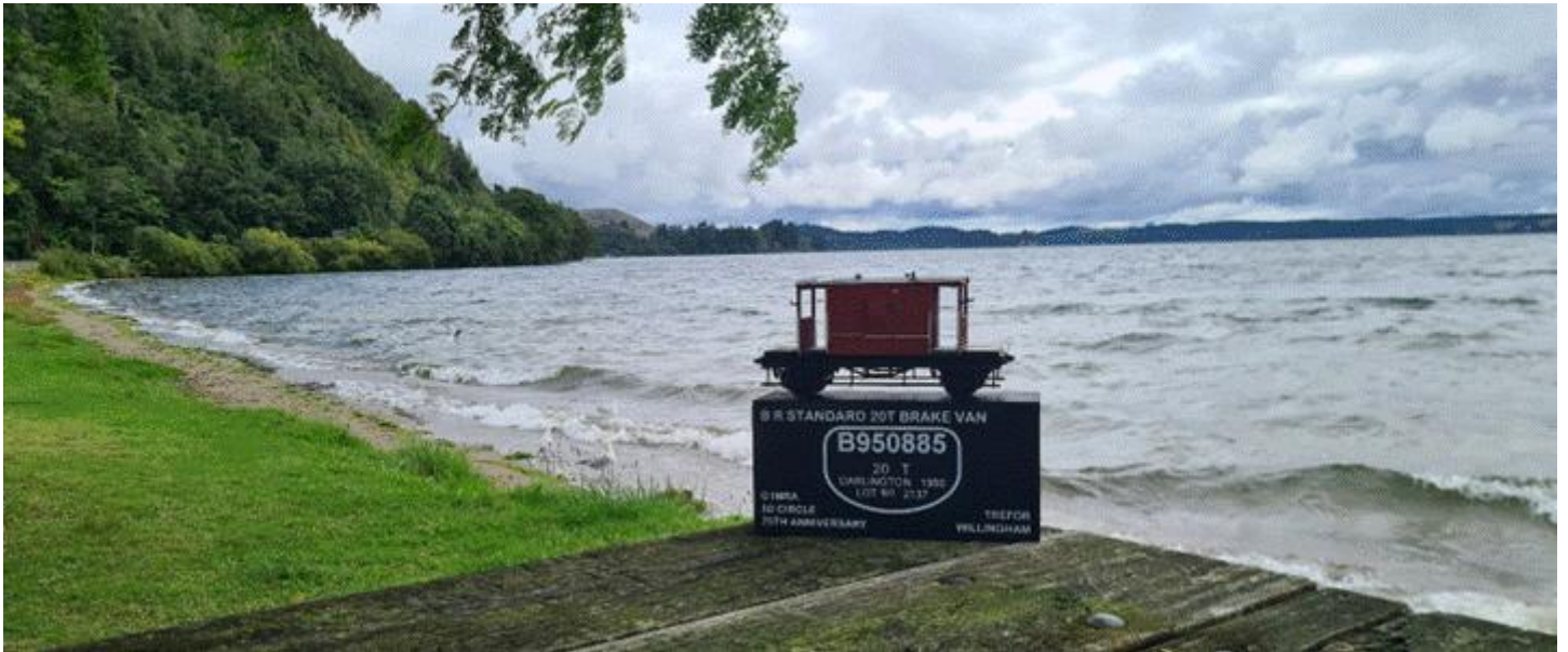
Our journey east took us past the Central North Island Lakes area. This is Lake Rotuma in somewhat unsettled conditions.