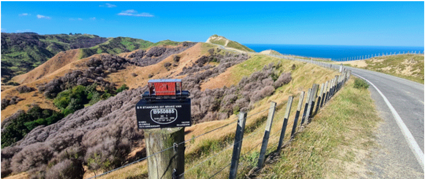
Further along looking back the way we had come.