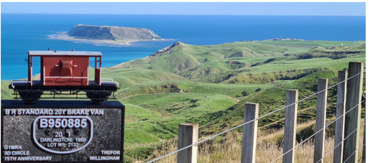
Close to the road end and the view down to launch site at the end of the peninsular on the flat ground on the right.