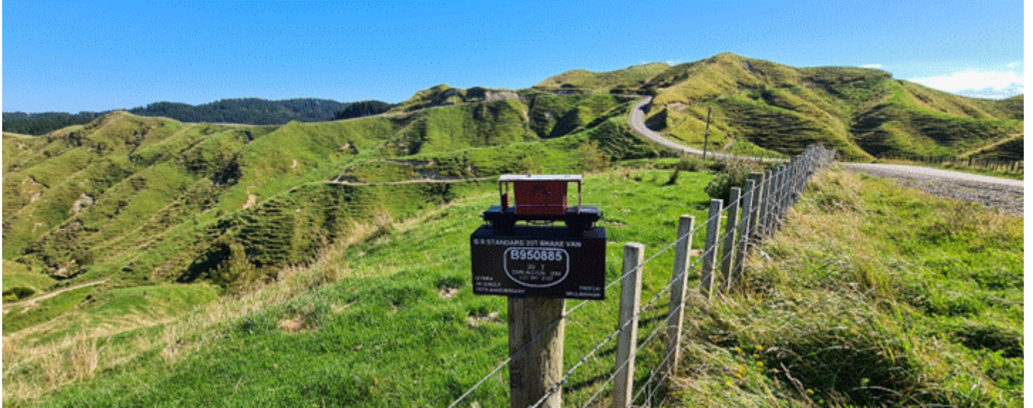
Day three saw us head south to the Mahia Peninsular and home of the RocketLab launch site. It's quite a drive out to the end of the peninsular to the point where the road and public access ends. This view is typical.