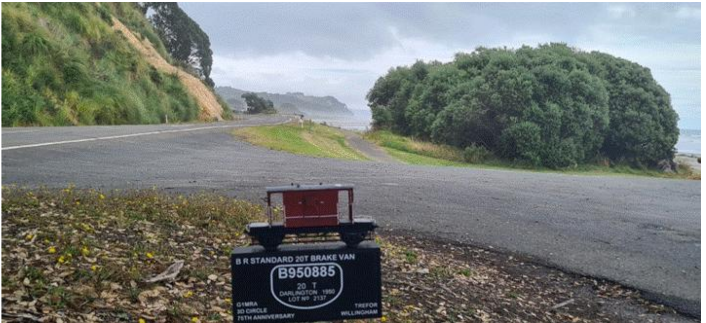
Further on we have reached the East Coast at the east end of the Bay of Plenty just before reaching Opotiki. At this point we turn sharp right (literally) to head across the Divide that separates the two tectonic plates NZ rests on.