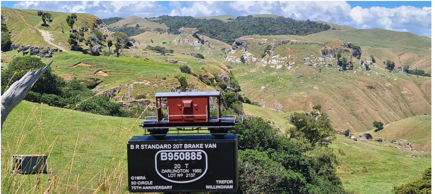
This is 'Weathertop'. For Lord of the Rings fans, it is the scene where Frodo was stabbed by the 'Black Riders' in the 'Fellowship of the Ring'. For those not sure, it's the mushroom topped outcrop directly above the brake van.