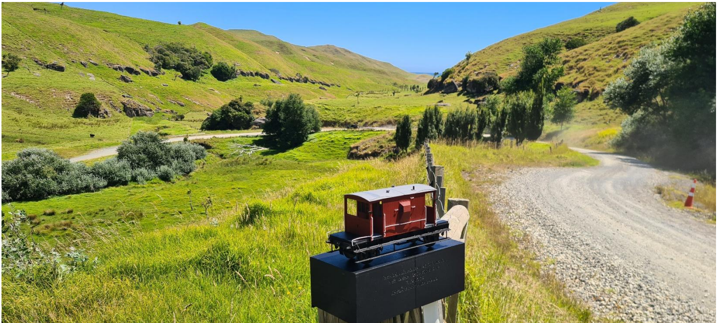
Reaching the base where the road does a hair pin turn to follow the valley back inland again. The Tasman Sea is just visible in the gap above the brake van.