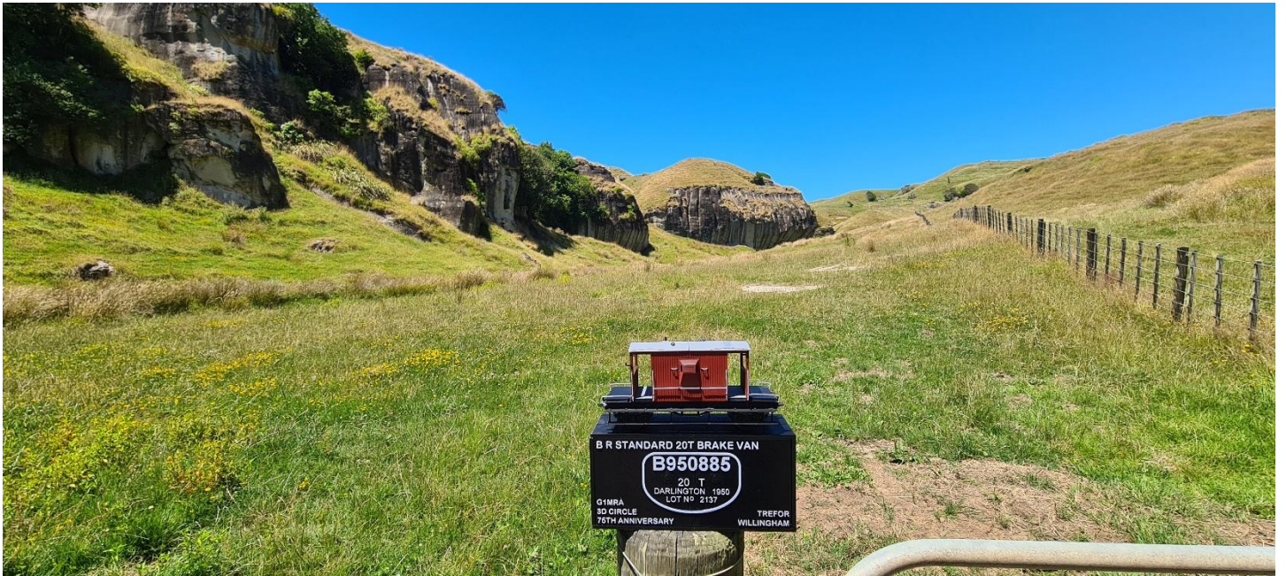
South west from the Tuakau Bridge takes us into some fairly remote countryside not often visited. It's limestone country with numerous outcrops, one of which is quite well known.