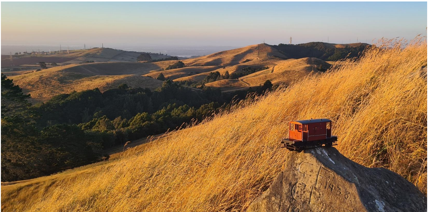
The view north from the summit. These hills present a barrier between Auckland and the Waikato Region to the south. The summit is right on the boundary between the Regions.