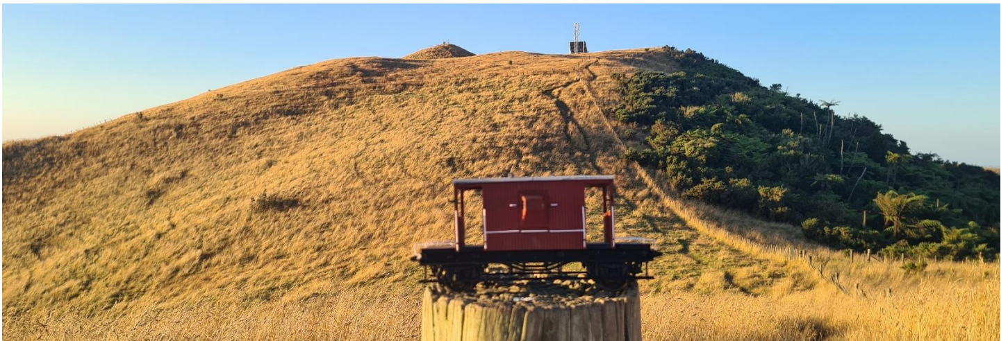
I also took the brake van on one of my local walks up Mount William. Its only five minutes' drive from home and has a terrific outlook over both the Waikato Plains and north to Auckland. This is looking up from the south up the final slopes to the summit.