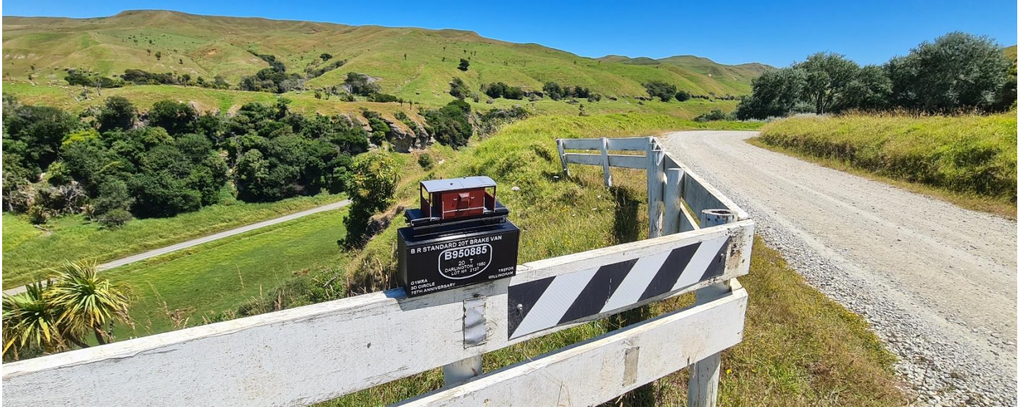
A little further south, the road reaches an impasse where it has to zig zag down to get around a line of cliffs. The continuation of the road is visible below the cliffs.