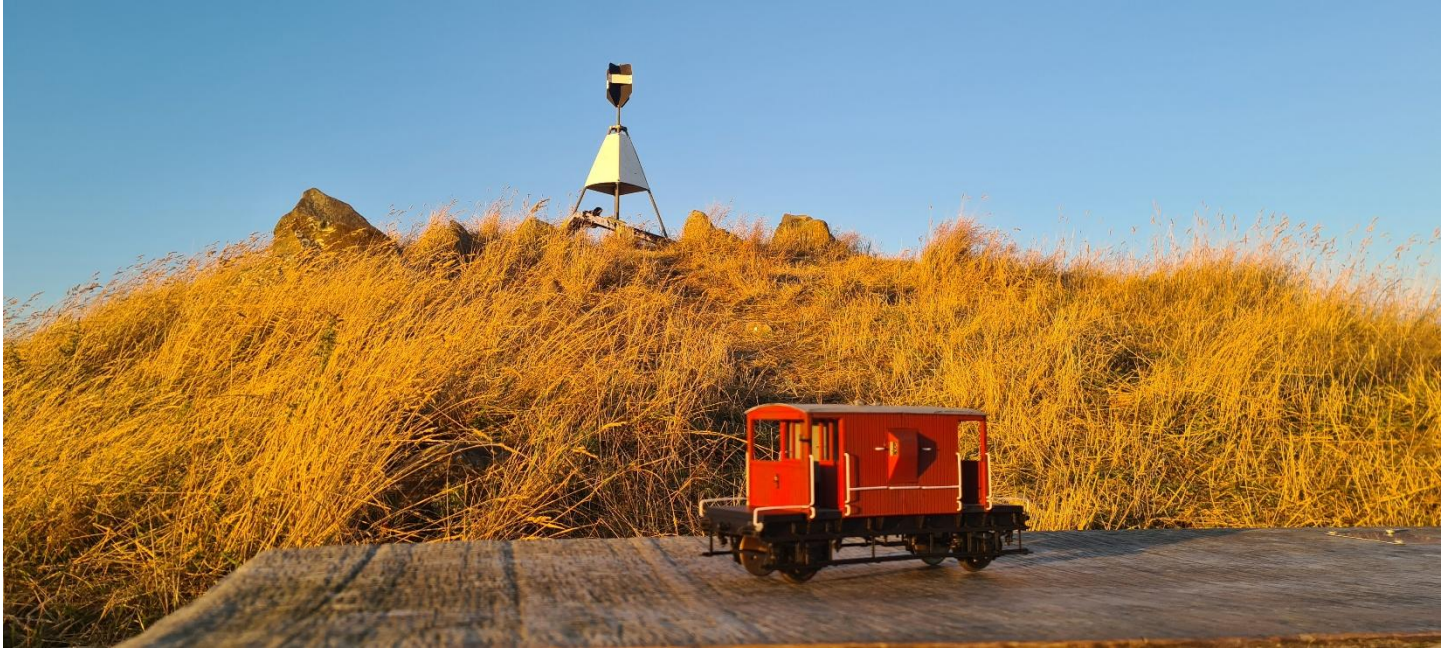
At the summit just on sunset.